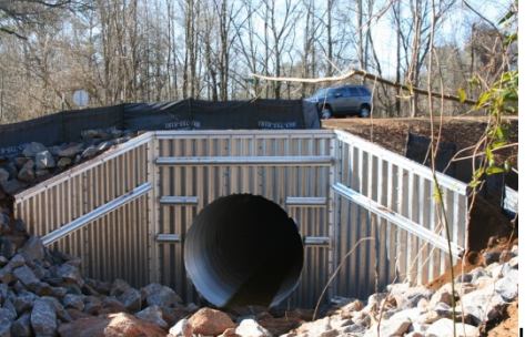
Use Pipe Wingwall