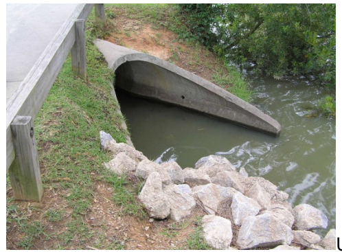
Use Pipe Flared End Section when specified in the plans or special provisions.

Use Pipe End Structure (719-615-00) when specified in the plans or special provisions. Use pipe end structure in locations where pipe exposed end faces the direction of traffic. Pipe end structures may be used in other locations if approved by the RCE.